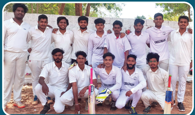
FOOTBALL & CRICKET