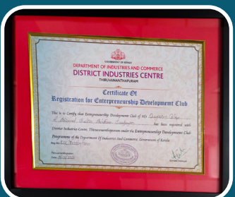
ED GOVT. CERTIFICATE